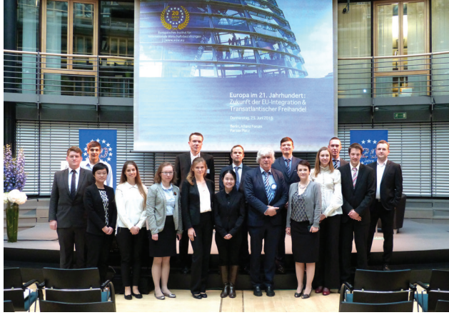
Workshop on the occasion of the 20th anniversary of the EIIW, Berlin, Allianz Forum, June 25th 2015 - Special Newsletter