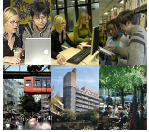
MASTER OF SCIENCE (M.Sc.) Applied Economics and International Economic Policy

Schumpeter School of Business and Economics