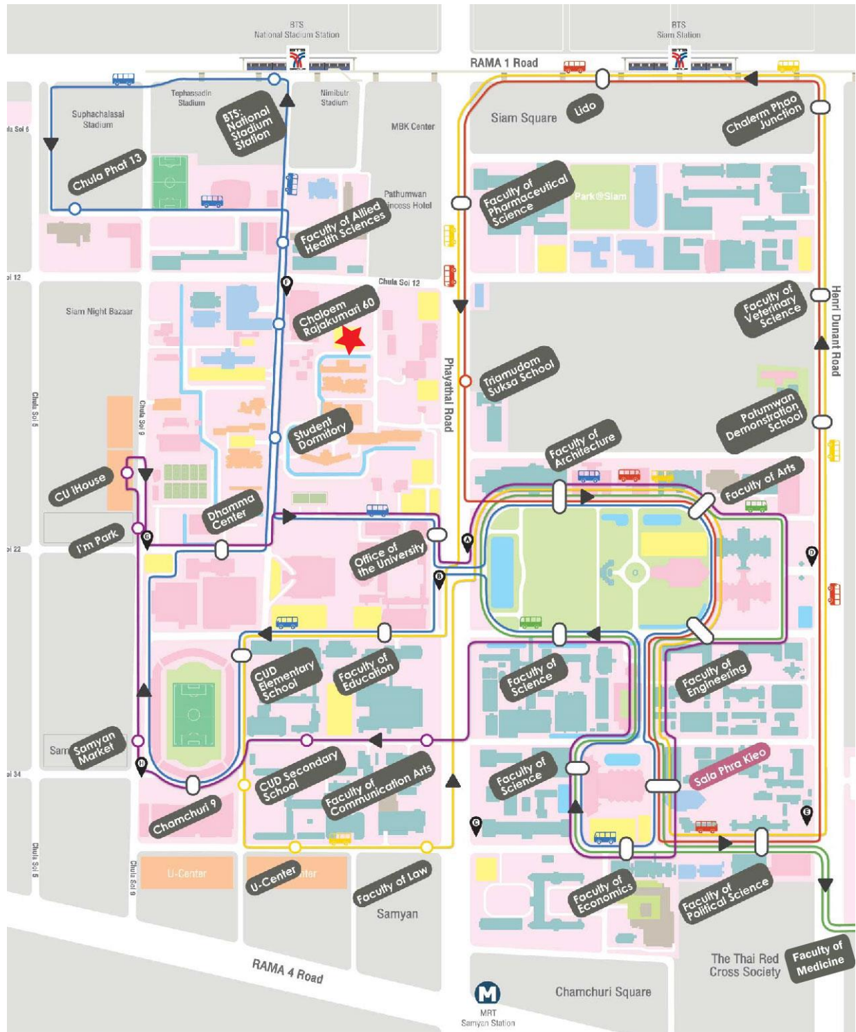
Figure 3: CU Shuttle Bus Map