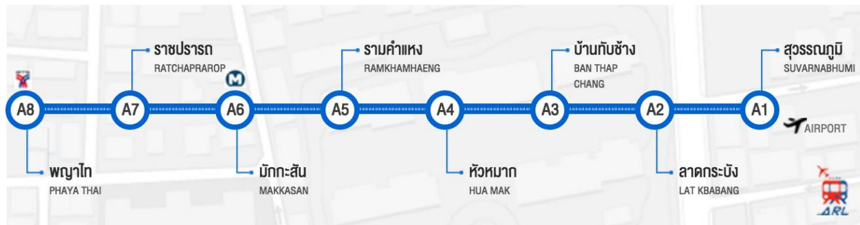
Figure 1: City Line Map

The nearest BTS stops for Chulalongkorn University campus and accommodation are National Stadium and Siam (which are a few stations away from Phaya Thai Station). The nearest MRT stop is Samyan. From the National Stadium Station, it is a walking distance to the accommodation arranged for conference participants (SASA International House). From the Siam BTS and Samyan MRT stops, you can take a taxi to reach your conference accommodation.